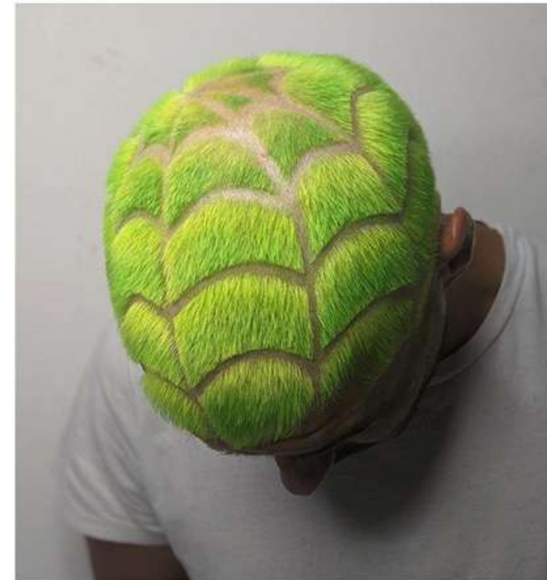
Be inspired by rave culture, neon fluffy outerwear, tie dye and ombre jackets and hats, super bright makeup