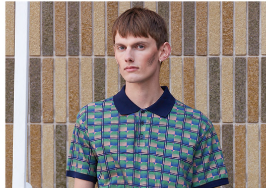
Be inspired by a 1950's retro mood, with polo shirts and high-waisted trousers for men, ruffles for women, and a fresh twist on Mid Century interiors