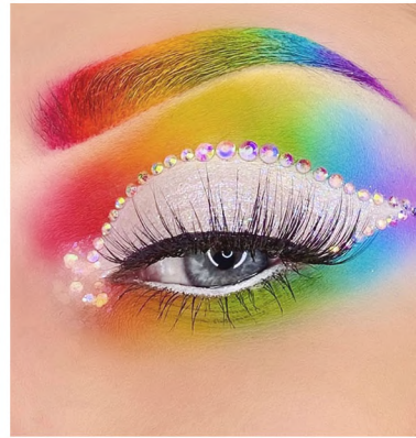
Be inspired by Pride celebrations, mixing rainbow details, clashing colour blocking, sequins and plenty of shine to create a playful party mood